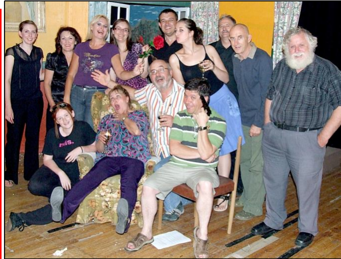
COMIC DESPERATION — The director cast and crew of current BP comedy engage in a lively discussion on how to entice more patrons to Blackwood 21 , including a threat to shoot one of the actors.